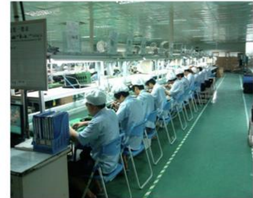
SMT & Assembly - Thailand