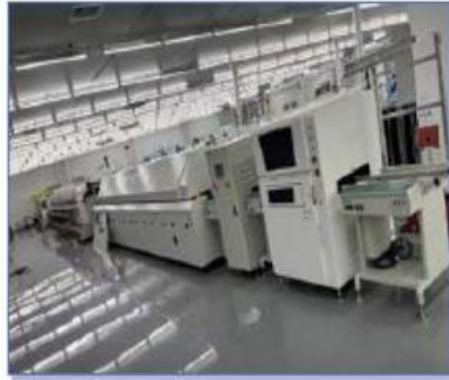
SMT & FATP Line (China)